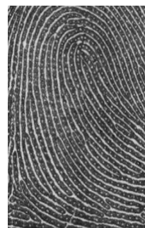
Fig.1. An example of high resolution partial fingerprint having hundreds of pores

Therefore, pores are particularly useful in high resolution partial fingerprint recognition where the number of minutiae is very limited.