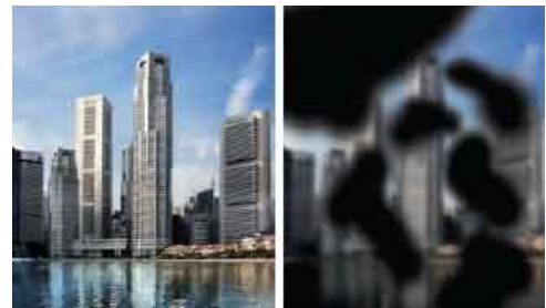
Fig.1. Vision of Normal person and DR Patient

second opinion at an ease [7]. According to the report from World Health Organization (WHO), India had 69.2 million people suffering with diabetes in 2015 and the diabetic population is expected to rise to 98 million in 2030. The annual death rate of diabetic patients in India is about 1 million. This alarming situation calls for immediate attention and redress. About 90% of people with diabetes for long period of time are at higher risk of developing diabetic retinopathy. The number of patients per ophthalmologist is very high in the order of 1 lakh patients per ophthalmologist [8]. In this context, automation in diagnosis facilitates the process of diagnosis in an efficient manner. An automatic system will be of immense help to the doctors in saving their precious time so that more attention can be paid to the people at high risk [9]. Diagnosis of diabetic retinopathy (DR) at an early stage and taking right treatment can save the patients from severe vision loss. This paper discusses the automatic diagnosis of diabetic retinopathy (DR) through the analysis of DR fundus images using combination of GLCM and WDM features [10].