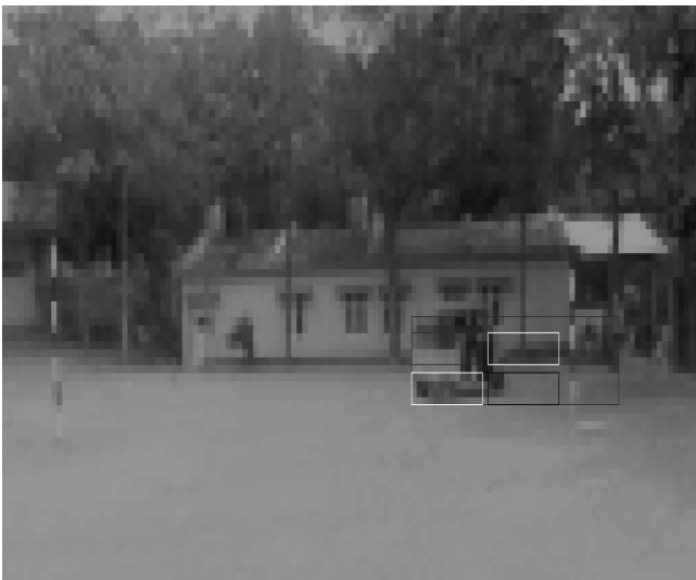
Fig.4. Image with block wise divided ROI (Block size increased)

Here we see the effect of step 13, where the estimated motion vector gets overlapped with existing motion vectors.