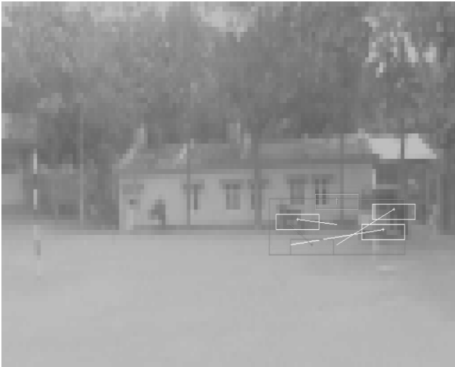
Fig.3. Image with overlapping motion vectors

Here we see the effect of step 13, where the estimated motion vector gets overlapped with existing motion vectors.