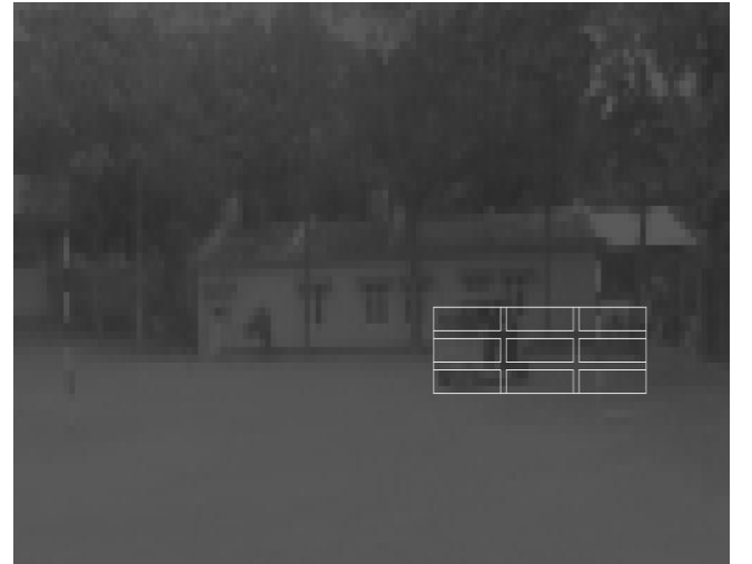
Fig.2. Image with block wise divided ROI

To evaluate the performance of the proposed method, experiments were carried out using IDL6.3 on Windows platform. The tracking results are considered for various settings including person riding a bicycle, person in a motor bike and moving of a vehicle. The videos used for tracking were taken by stationary camera and the method works well with frames overlaid with noise and even with dark scenes.