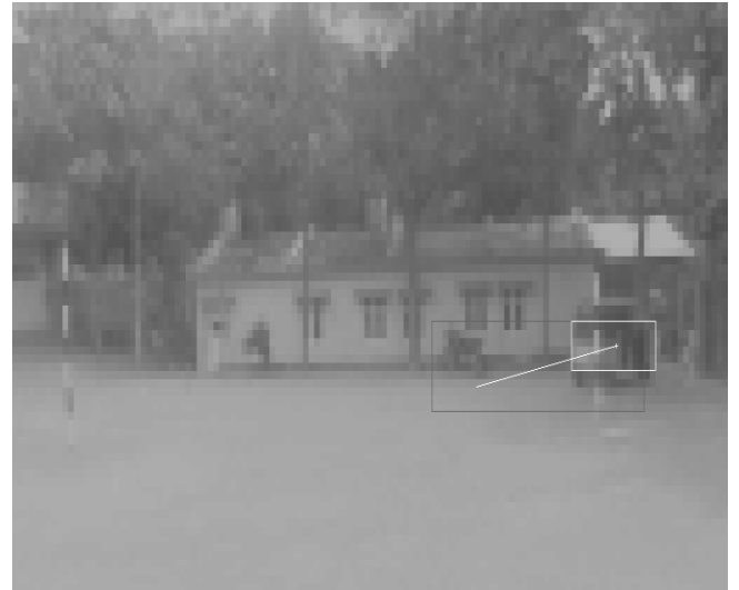
Fig.5. Tracked image with its direction of movement

As the blocks overlaps while block matching, and matches at more than one location the size of the block is increased. The whole Region of Interest is divided into 4 blocks. Similarly, as long as the number of overlapping is greater than one the process of division of ROI is repeated.