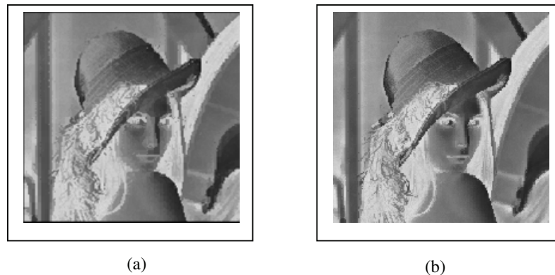
Fig.3. Comparison of the Proposed Work based on Neuro-Statistical Modeling and The Generalized SOM based Image Coder for Lena Image. (a) Generalized SOM method (b) Proposed method