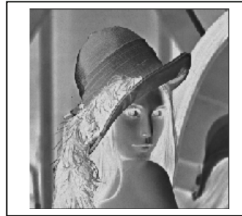
Fig.2. Original Lena image of size 256x256