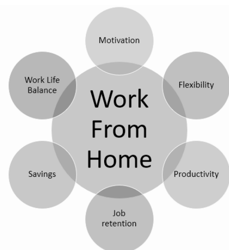
Fig.2. Requirements of work from home environment

The current pandemic has forced many businesses to shift to a work from home environment, and this has been especially disruptive for Information Technology (IT) employees. Working remotely has presented several challenges, not the least of which is a lack of motivation. This is particularly true for IT professionals who are used to working in an office environment with access to the latest technology and tools. Without the structure and support of a physical office, IT employees may feel overwhelmed and unable to stay motivated. The primary challenge for IT employees working from home is the lack of social interaction. In an office setting, IT professionals are able to ask questions, collaborate with their colleagues, and learn from each other. Working from home can create a feeling of isolation and disconnection from the team. It can also be difficult to maintain focus and productivity without the structure of an office environment. Another challenge for IT employees working from home is the lack of access to the latest technology and tools. The requirements of work from home environment is shown in Fig.2.